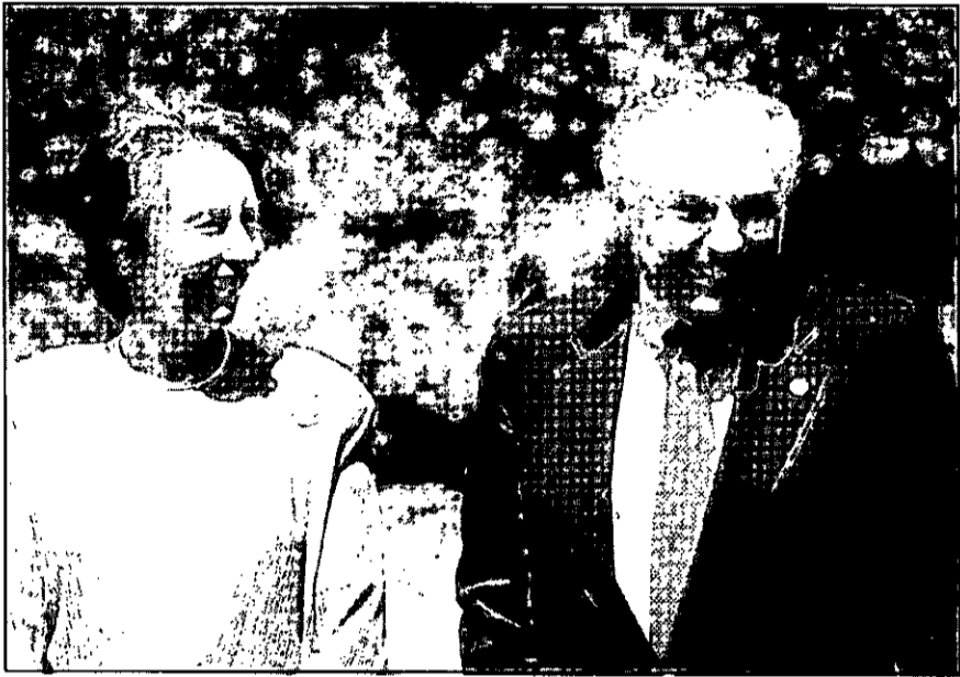
Colonial Williamsburg photo

INFORMATION ABOUT COLONIAL WILLIAMSBURG PEOPLE AND PROGRAMS VOLUME 53, NO. 32 AUGUST 8, 2000